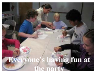
Everyone's having fun at the party